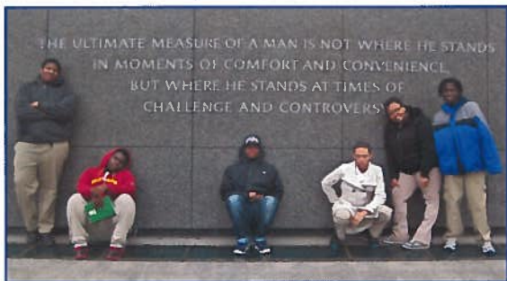
Pathways-Northwood students on an educational field trip to the Martin Luther King, Jr., memorial.