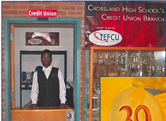
Pathways student teller at the In-School Branch of the Transit Employees Credit Union (TEFCU) at Crossland High School, the first in Prince George's County.

By staying focused on our goals, this year Pathways was able to live out our theme of moving forward together. The effort culminated in two events highlighting our 30 th Anniversary Year. The Fun Run was a testament to the success of everyone working together, whether corporate sponsors or individuals and staff members, who this year sold raffle tickets earning more than $2,000. The Student Art Show at Busboys and Poets in Hyattsville in May was a magnificent showcase for what our schools are all about—individualized instruction and therapeutic support enabling students to learn, develop their talents, build on their strengths and reach for their dreams.