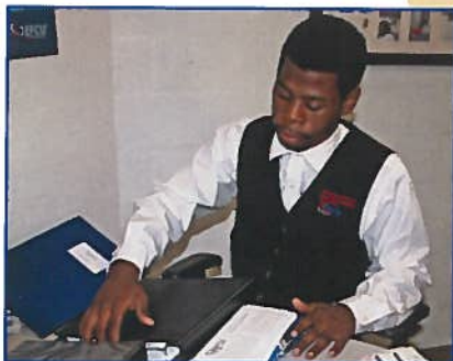
Student teller at work in the TEFCU In-School Branch