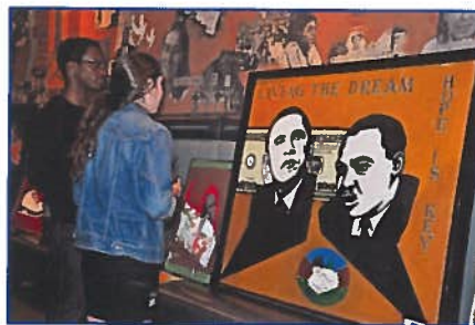
Guests at the art show admire student work.

Also in the arena of technology, Pathways launched a new website this year. The colorful, attractive site is user friendly and chock full of important information about our school programs. Check it out at www.pathwayschools.org .