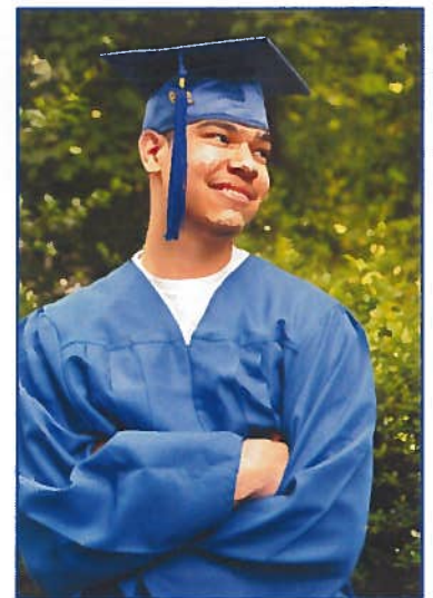
A Pathways-Edgewood graduate