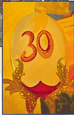
Detail of the mural celebrating Pathways' 30th year created by Anne Arundel students during an arts-integration residency project.