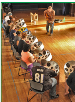
An arts-in-education workshop integrating music and social studies

We believe they can indeed be tomorrow’s leaders, and here in words from this school year, they speak for themselves: