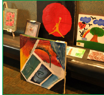
Student work on display at the art show