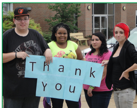
Pathways students expressing their gratitude