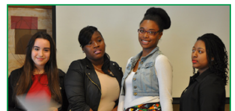
Four young women in the Entrepreneurship Program after the award luncheon in May

unique to women in the business sector. Four young women students from three Pathways sites participated in the workshops, which were taught by women entrepreneurs. ♦