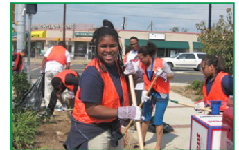
Students tending street side garden in Hyattsville

I love the Pathways School with all my heart! It ..... has the world’s best learning environment ever.